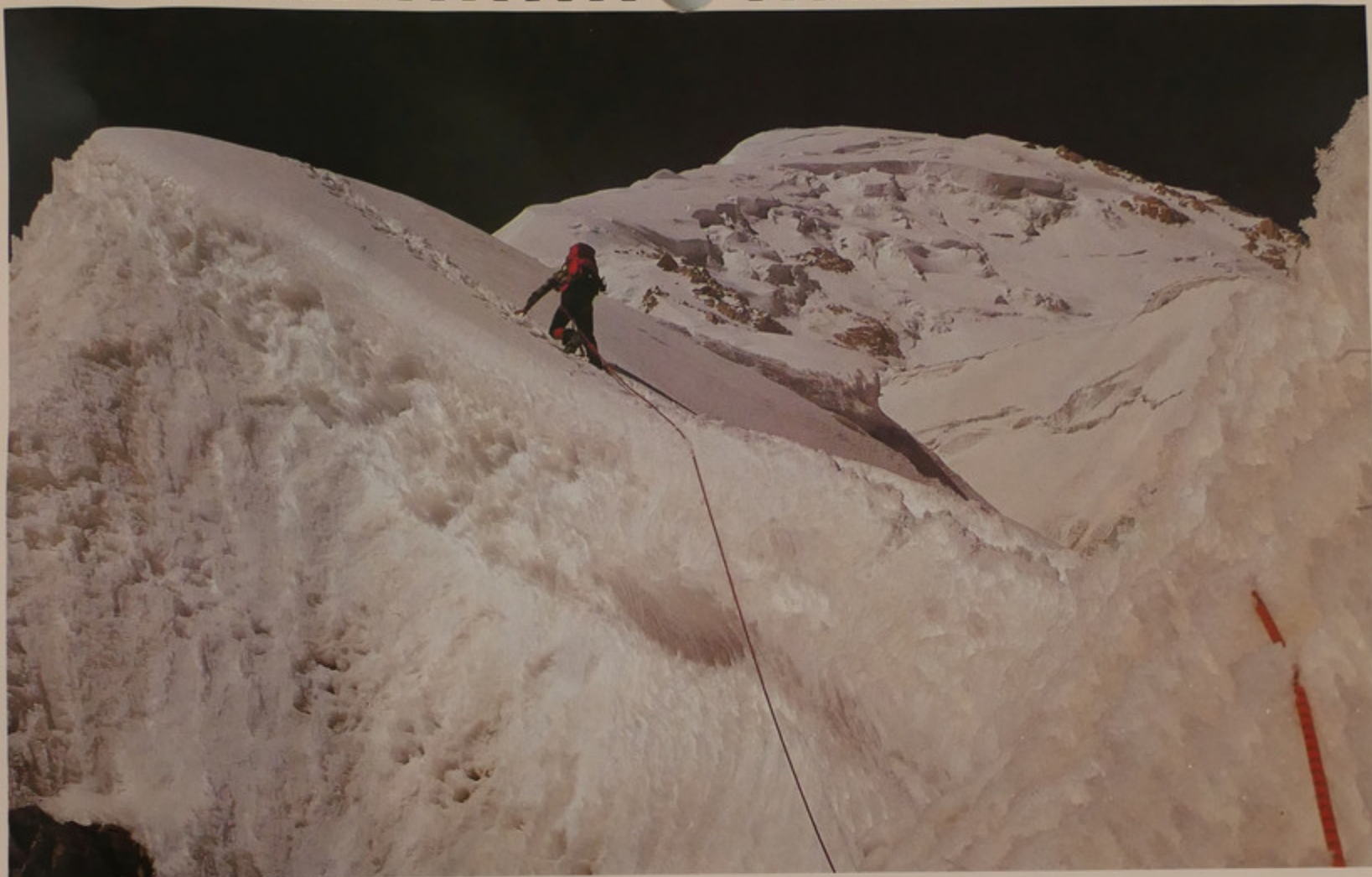
Hindukusi: Prvi vzpon na Vzhodni Tirič Mir z vzhoda. Hindukush: the first ascent of the Tirich Mir East Peak (7692 m) by the East ridge.