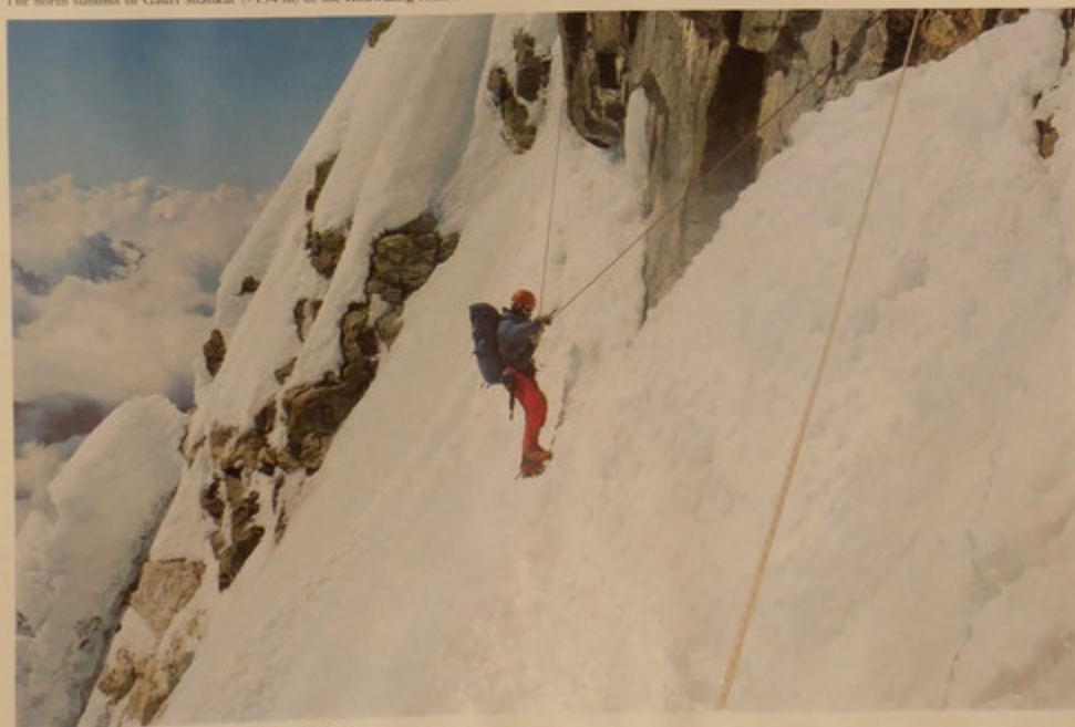
Prečnica v južni steni Gauri Shankarja. The Traverse in Gauri Shankar South Face.