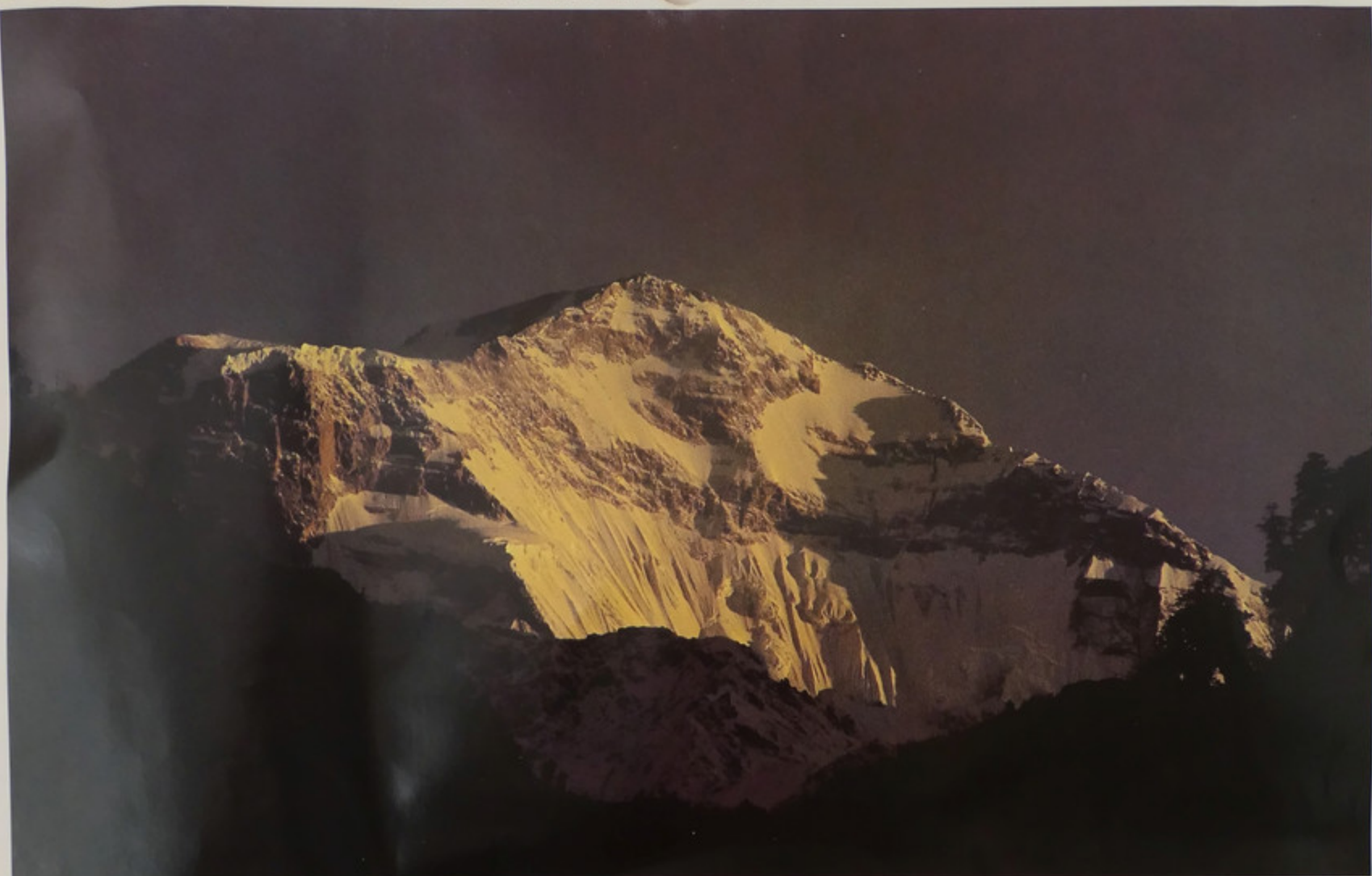
Vrh Dhaulagiri (8167 m) z juga. The upper part of Dhaulagiri South Face.