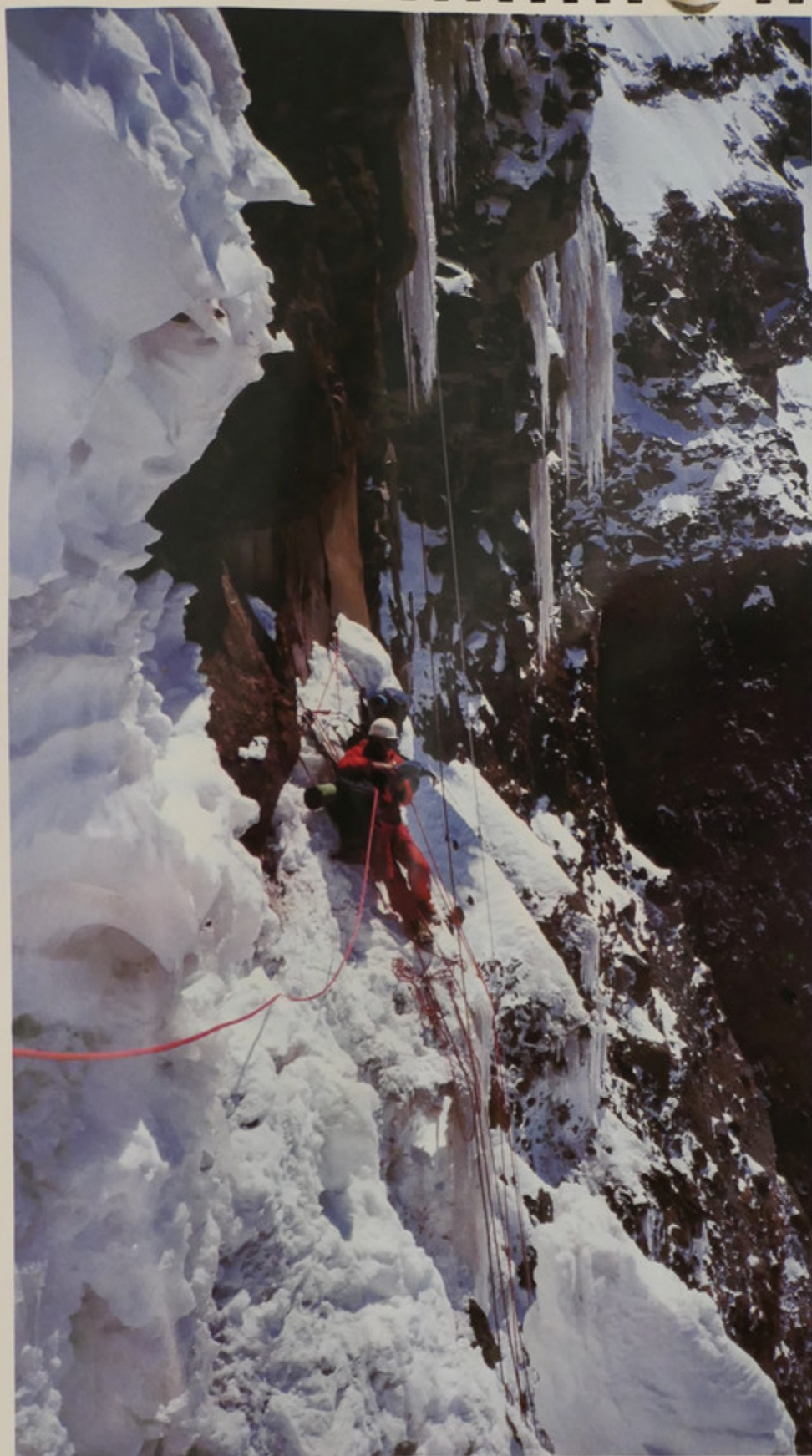
Vetrovaliče v južni steni Aconkagve Sur (6930 m). The Yugoslav route in the South Face of Aconcagua Sur (6930 m).