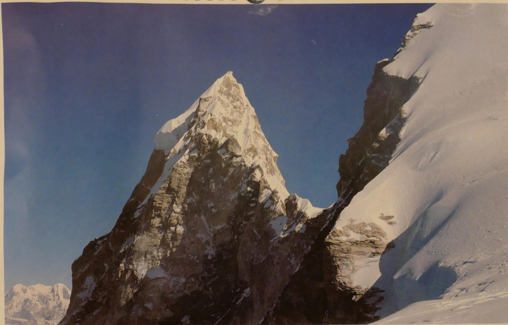
Severni vrh Gauri Shankarja (7134 m). The north summit of Gauri Shankar (7134 m) in the Rolwaling Himal.