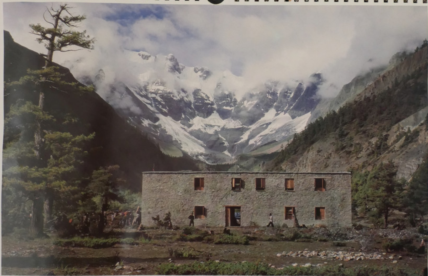
Sola za gorške vodnike v Manang je darilo Jugoslavije Nepalu. Mountain guides school in Manang, a Yugoslav gift to Nepal.