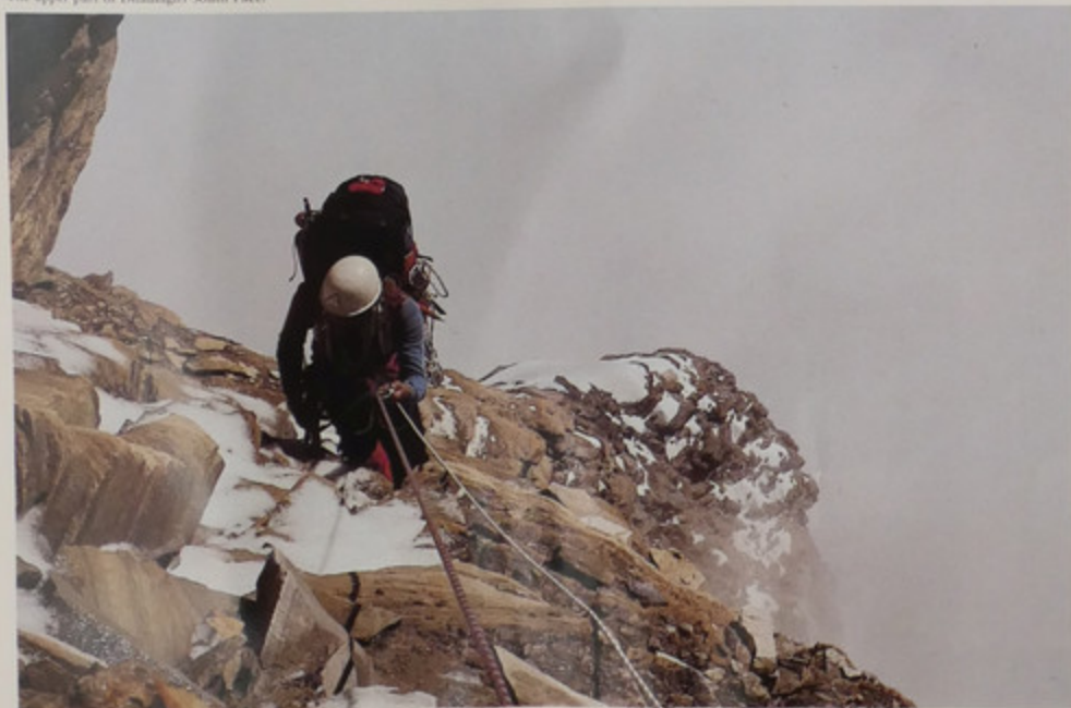
Prvi vzpon v južni steni Dhaulagiri. The first ascent on the Dhaulagiri South Face.