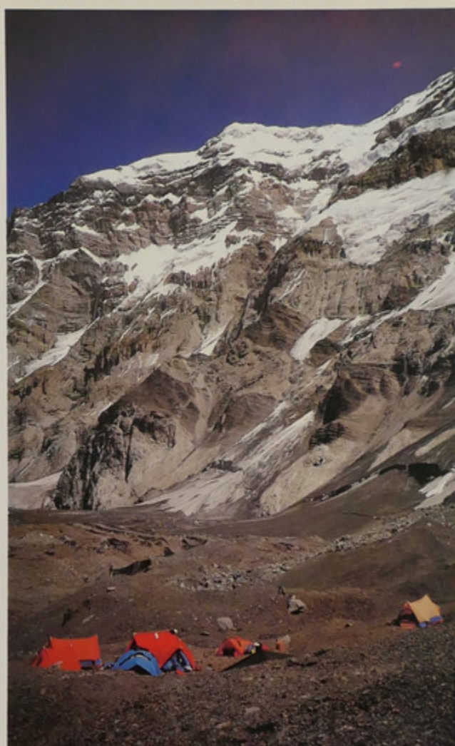
Tabor pod Aconkagvo (6939 m), najvišjim vrhom Amerike. Base Camp at the foot of Aconcagua, America's highest peak.