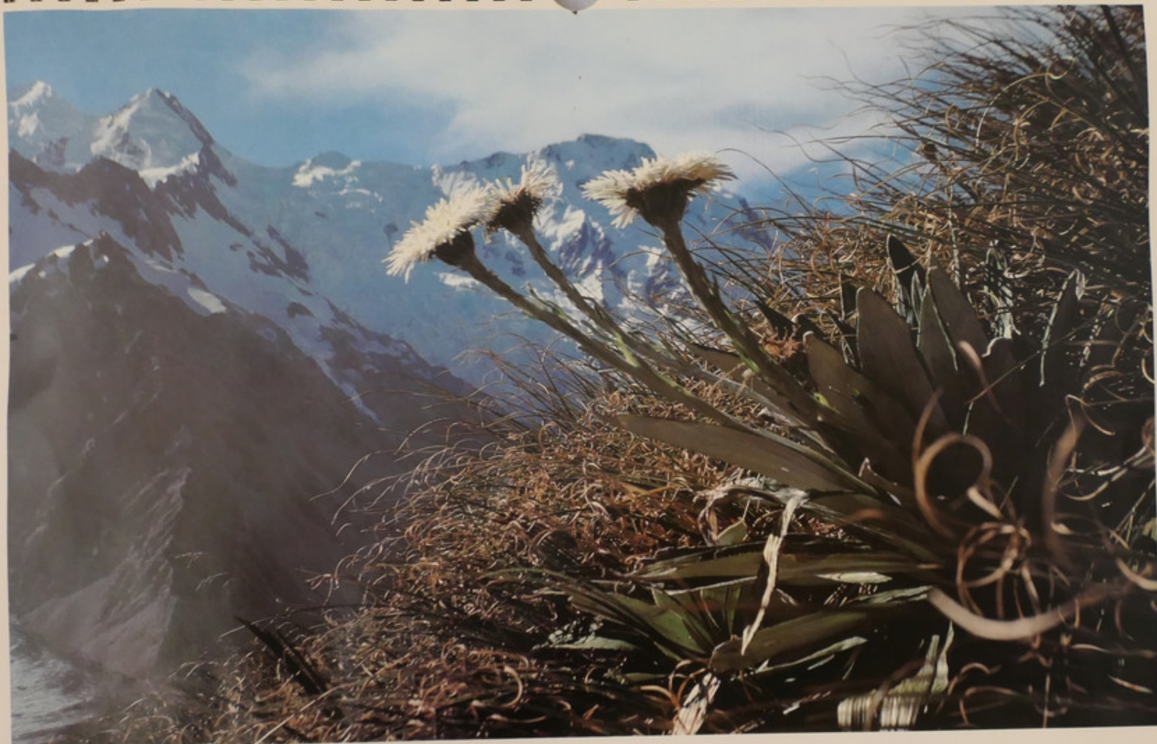
Južne Alpe v Novi Zelandiji. The New Zealand Southern Alps.