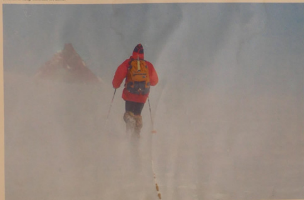
Vihar pod Asassara fjeldom (3200 m). Storm -pitorac- under Asassara fjeld.