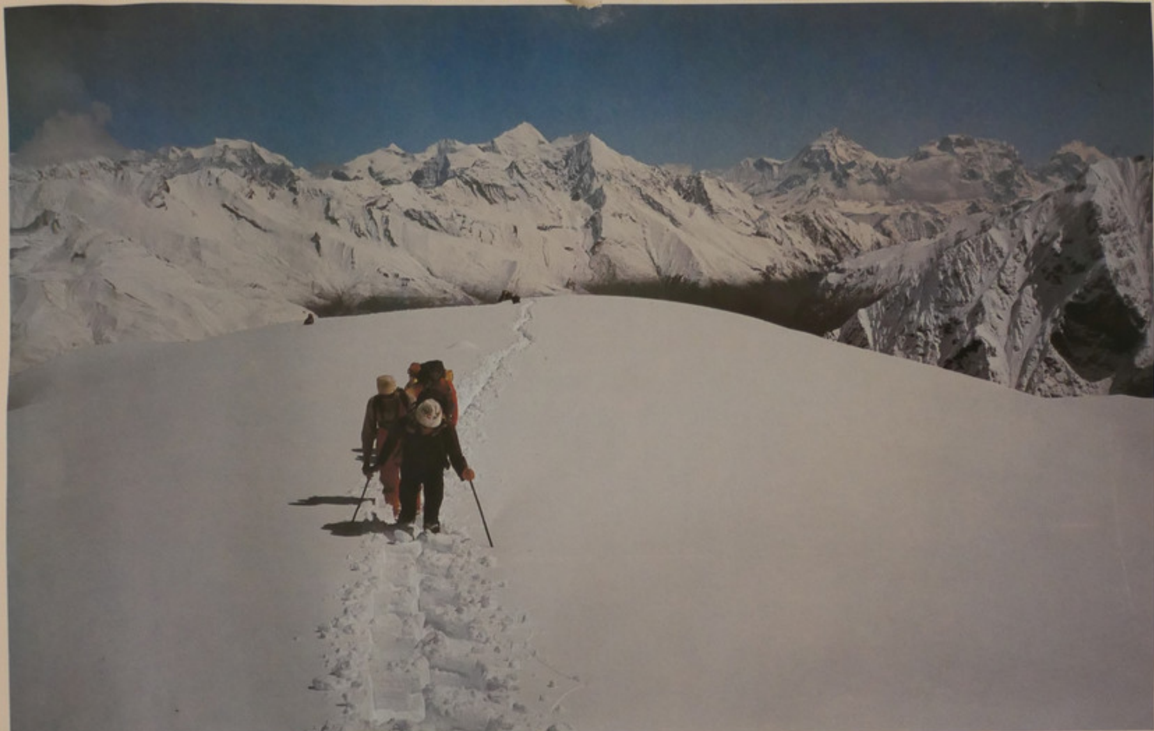
Vrpon na Gangapurno, desno zadaj Manaslu 8163 m. Climbing Gangapurna, with Manaslu to the right.