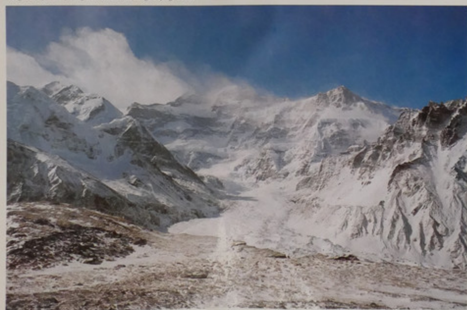
Kangcendzonga s severa; od leve: Gungela Chuli (Twins, 7350 m), Glavni vrh (8586 m), Jalang Kang (805 m), Jangbachen (7903 m). The Kangchenjunga Himal; from left to right: Gungela Chuli (the Twins, 7350 m), Main peak (8586 m), Yalung Kang (8505 m) and Kangbachen Peak (7903 m).