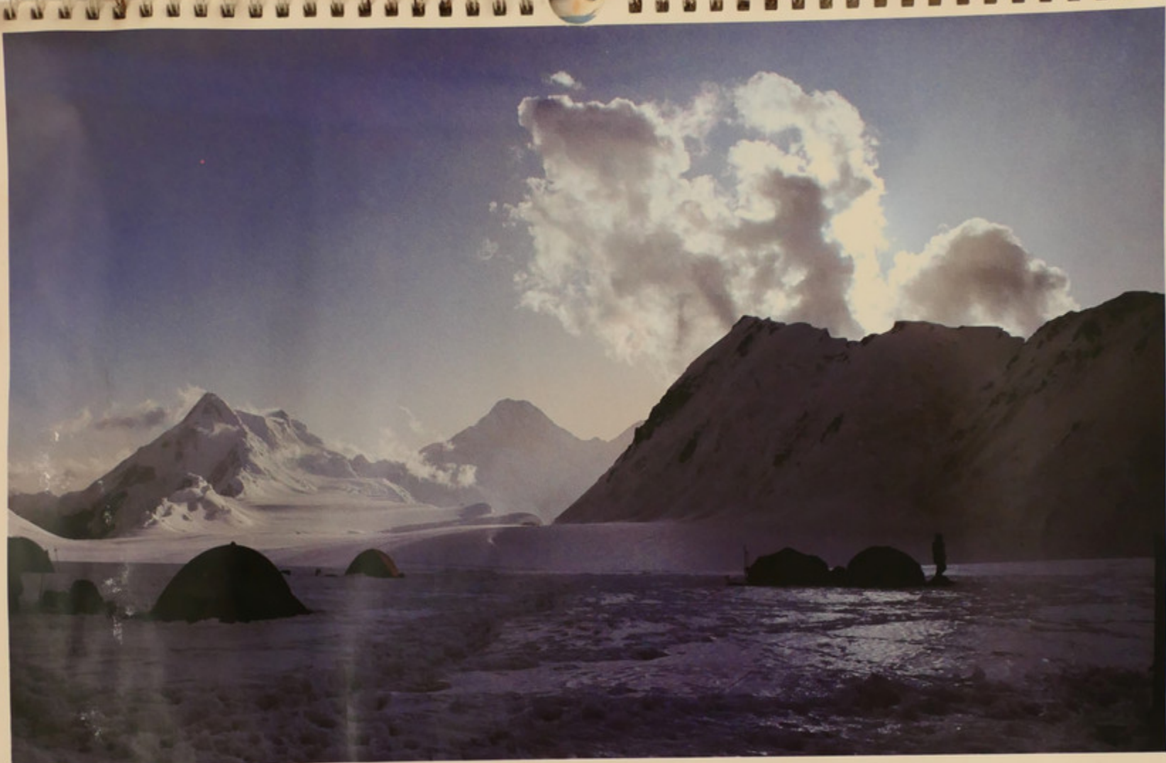
Pamirski plato (6000 m), zadaj Pk Moskva (6785 m). Pamir Plateau under Peak Kommunism (7495 m), with Peak Moskva in the background.