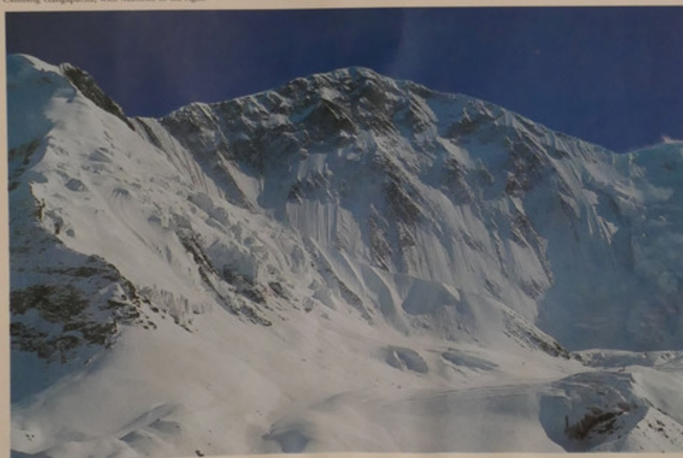
Gangapurna (7455 m) s severa. Gangapurna from the north.