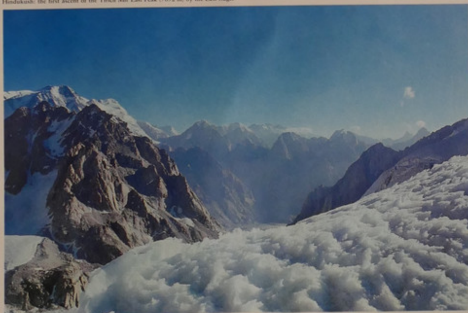
Na vzhodnem grebenu Tirič Mira – zadaj Istor-o-nal (7402 m), levo Nohaq (7480 m). View on Nohaq (left) and Istor-o-nal (centre) from the East ridge of Tirich Mir.