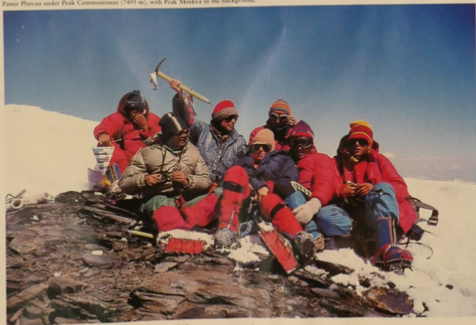
Sedem deklet na vrhu Pk Komunizma (7495 m). Seven Yugoslav women climbers on the summit of Peak Kommunism, the highest mountain in the USSR.