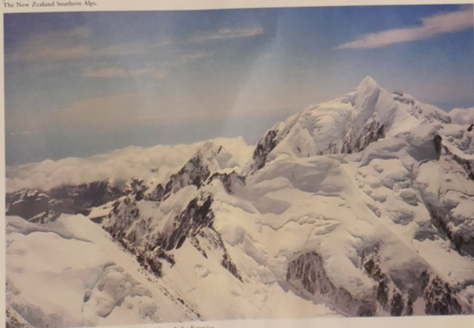
Mt. Tasman (3498 m) z vrha Mt. Cooka (3764 m). Mt. Tasman seen from Mt. Cook.