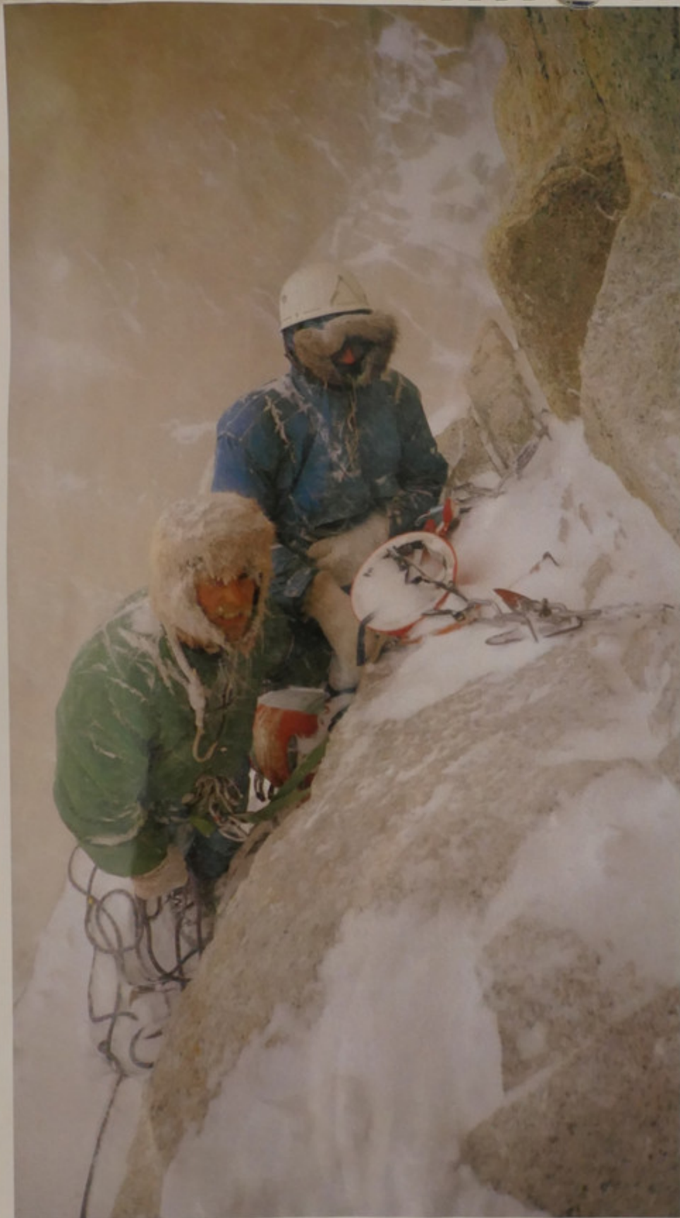
Snežni vihar v smeri Fitz Roya. Snow storm in the Yugoslav route on Fitz Roy.