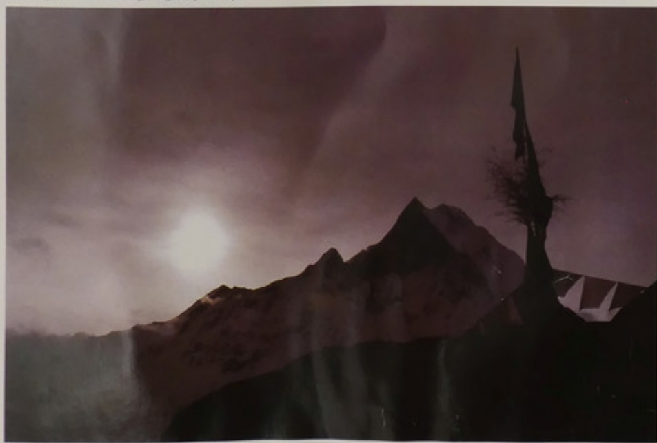
Sveta gora Mača puči (Ribič rep, 6993 m). The holy mountain Mischpachare (Fish Tail)