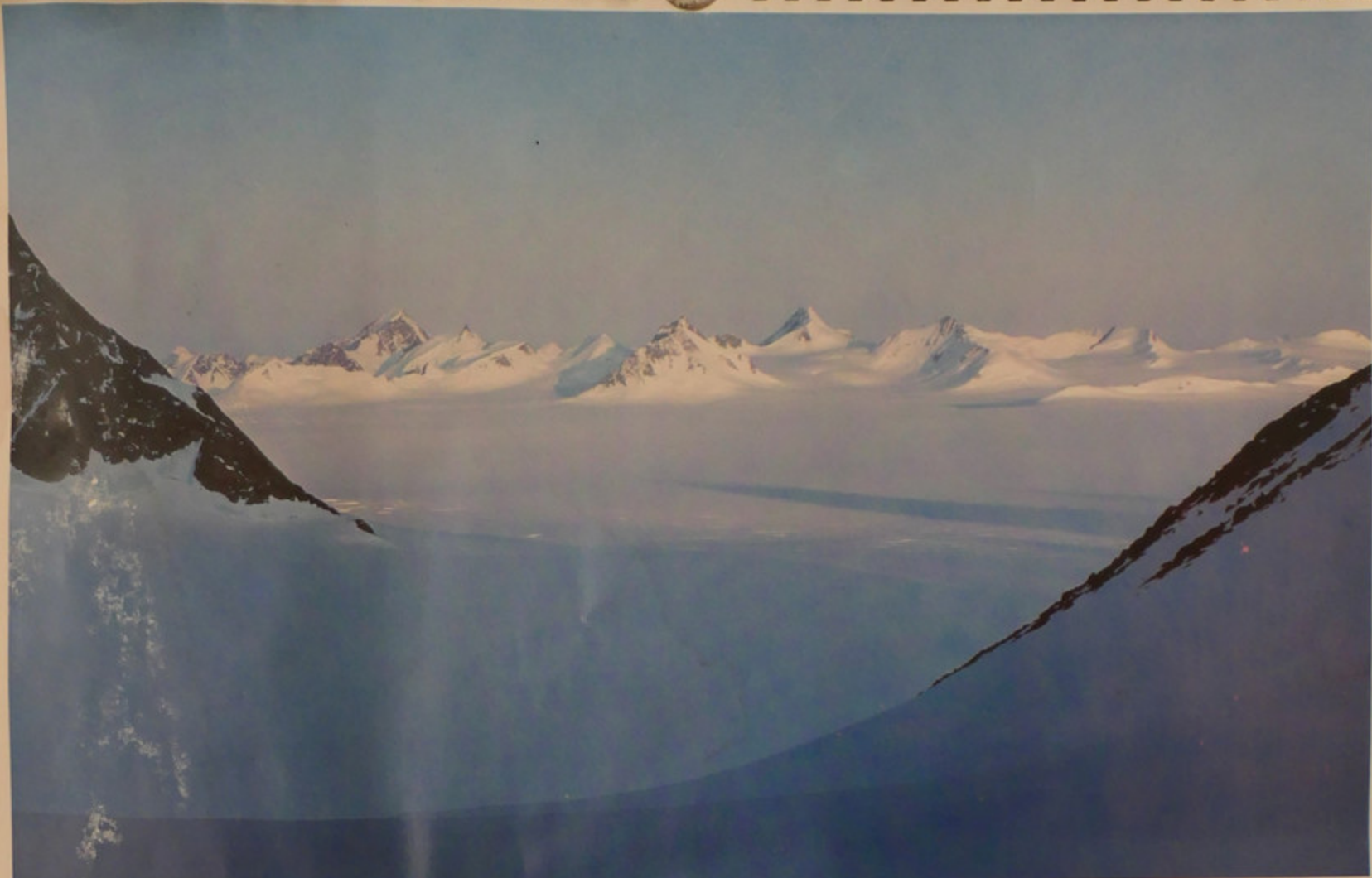
Greenlandске gore na območju ledenika Steenstrup Nordre Ilrac. Greenland: King Christian IX Land.