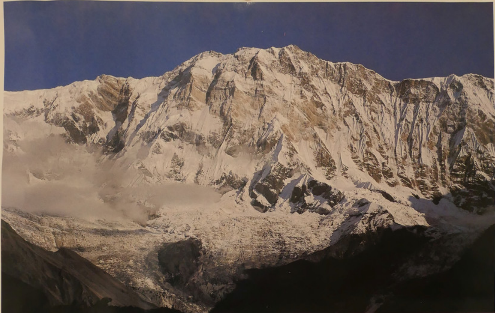
Južna stena Annapurne I (8091 m). South Face of Annapurna I.