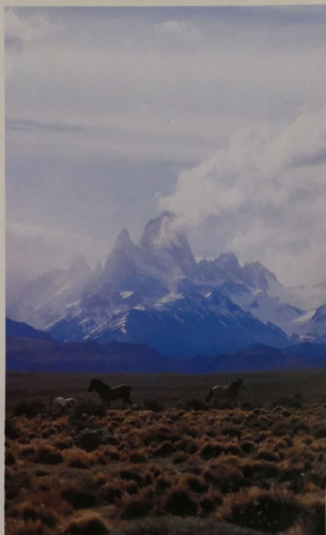
Fitz Roy (3375 m) je najvišja gora Patagonije. Fitz Roy, the highest mountain in Patagonia.