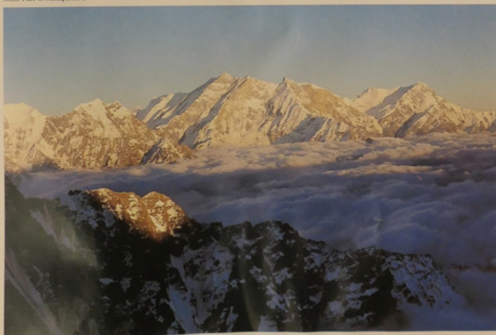
Skupina Anapurne od zahoda. The Annapurna Himal from the west.